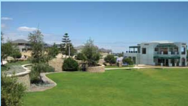
South west view